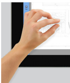
Touchscreen Full HD 22" touchscreen