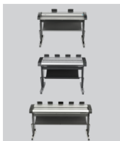
Your choice of scanner IQ Quattro X 44 inches HD Ultra X 42 inches HD Ultra X 60 inches